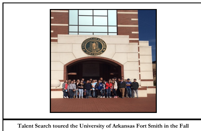
Talent Search toured the University of Arkansas Fort Smith in the Fall

AP and Concurrent classes are not the only way students at Hector can earn college credit. Starting with the 2018 -2019 school year, students in the 10th grade will have the same opportunity that 11th and 12th grade students have had of going to the Arkansas Tech Career Center during the day to take technical courses. These